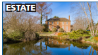
ESTATE St. Stephens Church: c1812 Manor House on 400 Acres