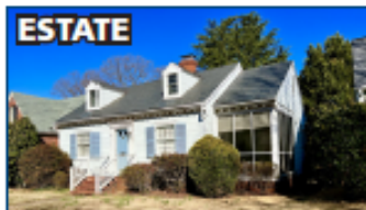
ESTATE Richmond: 934 Finished SF Cape Cod Needing Updates