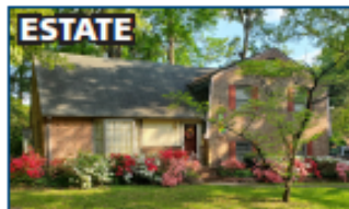
ESTATE N. Chesterfield: Quad-Level Home Needing Updates