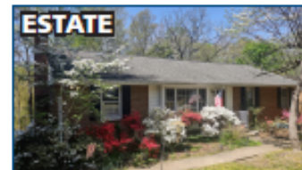
ESTATE Mechanicsville: 3 BR, 1.5 BA Home Needing Updates

Online, sealed bid, and live auctions | Free and always confidential consultations