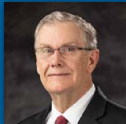
Hon. Bruce D. White (Ret.) Retired Chief Judge, 19th Judicial Circuit Court of Virginia, Fairfax County