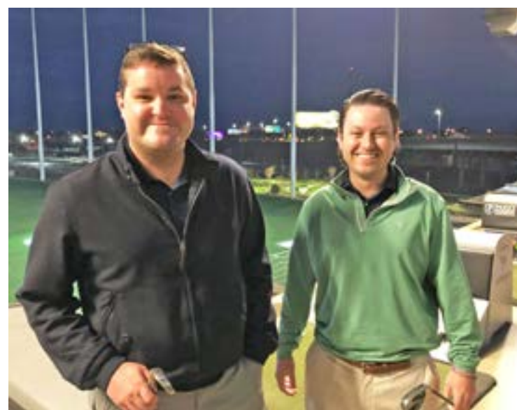
Business Law Section members enjoyed food, libations and games at their Social held on February 24th at Topgolf.