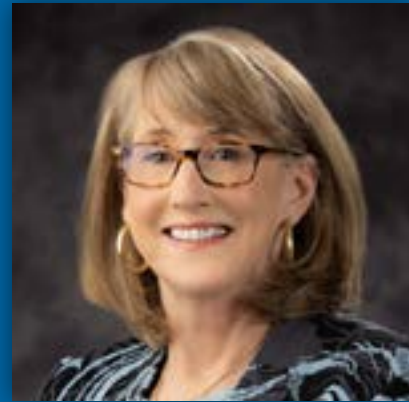
Hon. Beverly W. Snukals (Ret.) Retired Judge, 13th Judicial Circuit Court of Virginia, Richmond