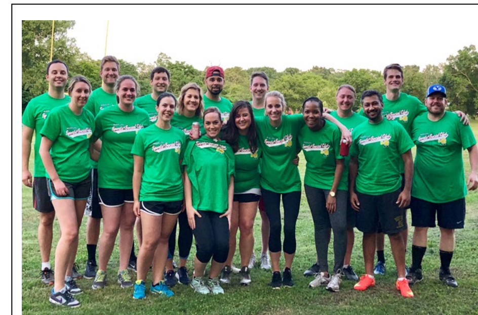
The RBA Young Lawyers' Summer kickball team, Hit & Run, just finished a winning season (in spirit, if not by numbers). The team enjoyed a season of wins and losses, highs and lows, but best of all, a good time had by all. Keep an eye on your email for sign-ups for Winter Dodgeball!!

The Section graciously thanks its sponsor, TransPerfect Legal Solutions .