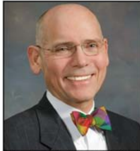
Hon. B. Waugh Crigler (Ret.)

Retired Magistrate Judge United States District Court Western District of Virginia